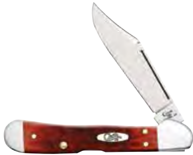
06996 MINI COPPERLOCK®