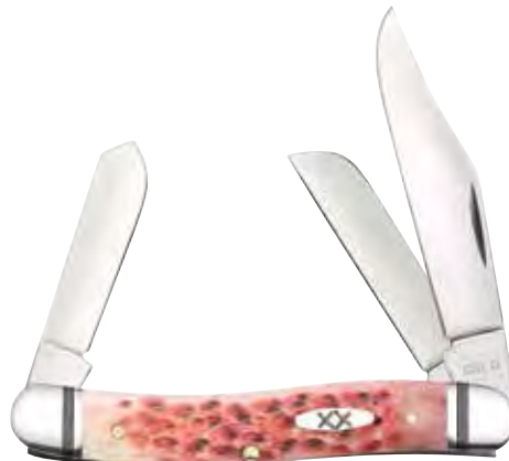
NEW 27725 STOCKMAN