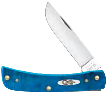
NEW 25590 SOD BUSTER JR®