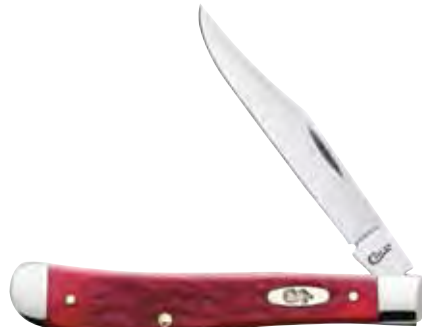
06982 SLIMLINE TRAPPER