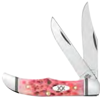
NEW 27723 POCKET HUNTER