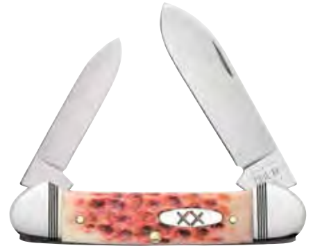
NEW 27722 CANOE