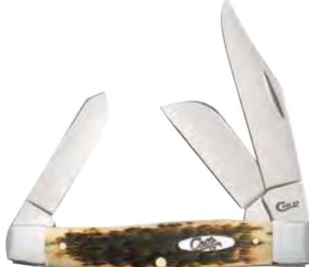
00204 LARGE STOCKMAN