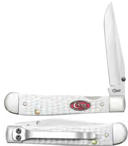
60191 KICKSTART® TRAPPERLOCK