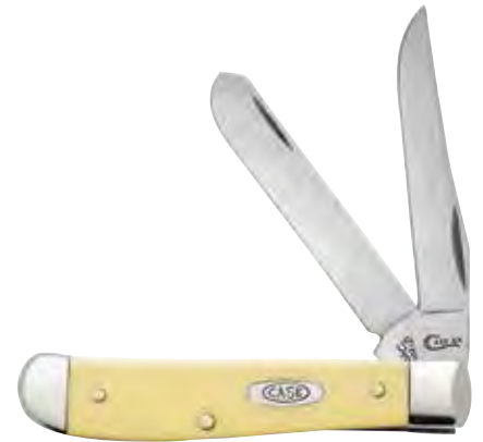
00029 MINI TRAPPER