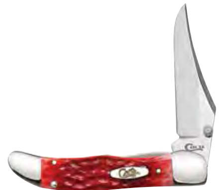
07003 KICKSTART® MID-FOLDING HUNTER

06981 MEDIUM STOCKMAN 6344 CV • Clip, Sheepfoot and Pen Blades 3 ¾ in (8.3 cm) closed, 1.7 oz (48.2 g)