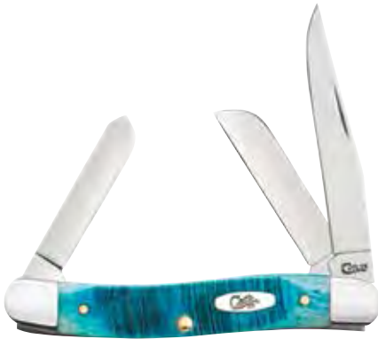
25597 MEDIUM STOCKMAN