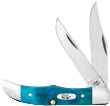
NEW 25591 POCKET HUNTER

Dazzling, Sawcut jiggled bone in stunning Caribbean Blue draws the eye to a convergence of color, craftsmanship, and convenience. This azure stunner complements a design that features the Case Oval Script shield, accenting the mirror-polished Tru-Sharp™ surgical steel blades. Wow your friends and family with this glittering jewel.