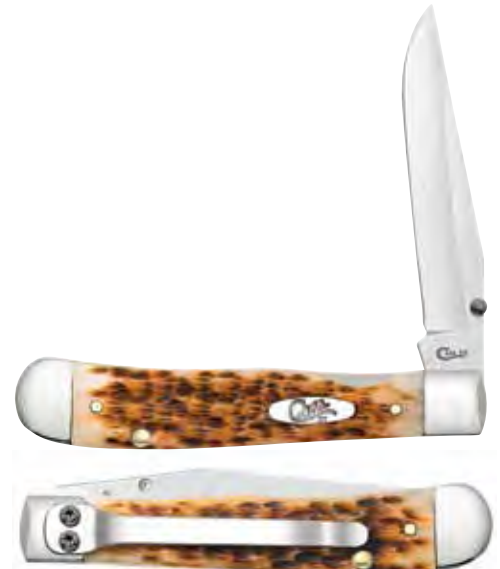
30090 KICKSTART® TRAPPERLOCK

00039 MEDIUM STOCKMAN 6318 CV • Clip, Sheetfoot and Spey Blades 3 7/8 in (9.2 cm) closed, 2.5 oz (70.9 g)