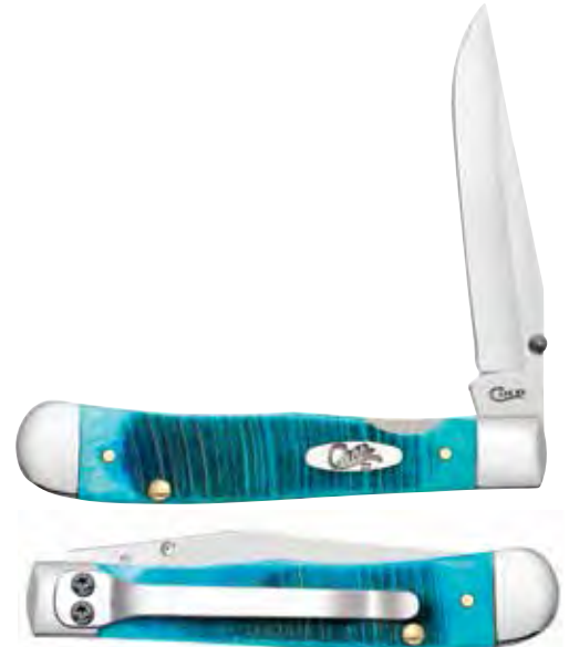
25594 KICKSTART® MID-FOLDING HUNTER

25590 SOD BUSTER JR® 6137 SS • Skinner Blade 3 3/8 in (9.2 cm) closed, 2.1 oz (59.3 g)