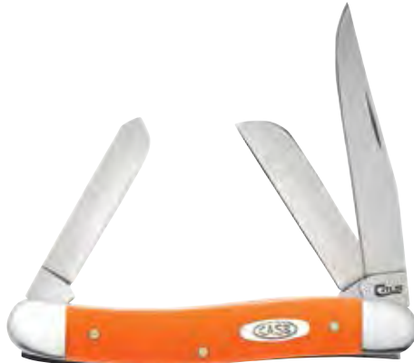
80509 MEDIUM STOCKMAN