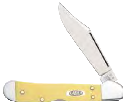
NEW 30116 MINI COPPERLOCK®