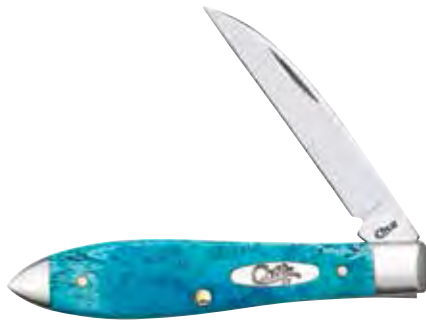
25599 TEAR DROP