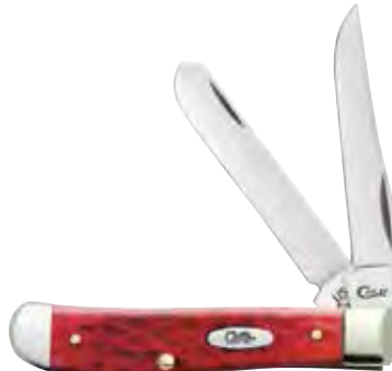
06983 MINI TRAPPER