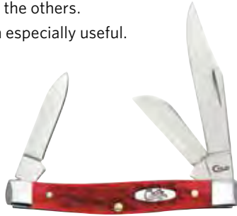
06981 MEDIUM STOCKMAN

Deep red handles make these knives stand out from all the others. Easy-sharpening Chrome Vanadium blades make them especially useful.