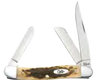
00039 MEDIUM STOCKMAN