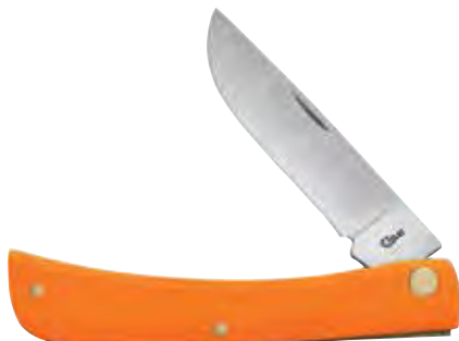
80502 SOD BUSTER JR®