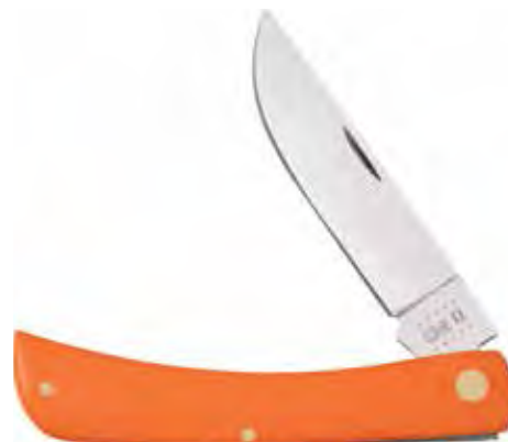
NEW 80512 SOD BUSTER®