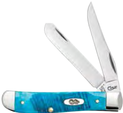
25593 MINI TRAPPER