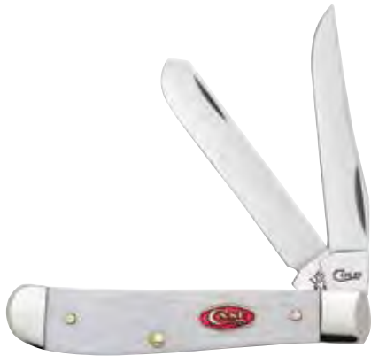
60186 MINI TRAPPER