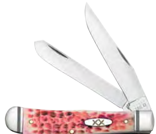
NEW 27720 TRAPPER