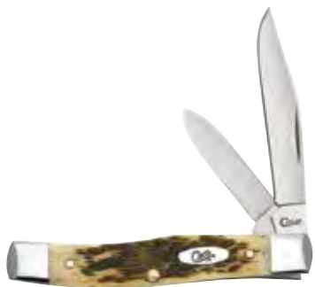
00077 TEXAS JACK