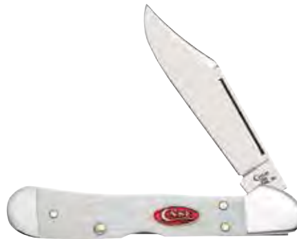
60185 MINI COPPERLOCK®