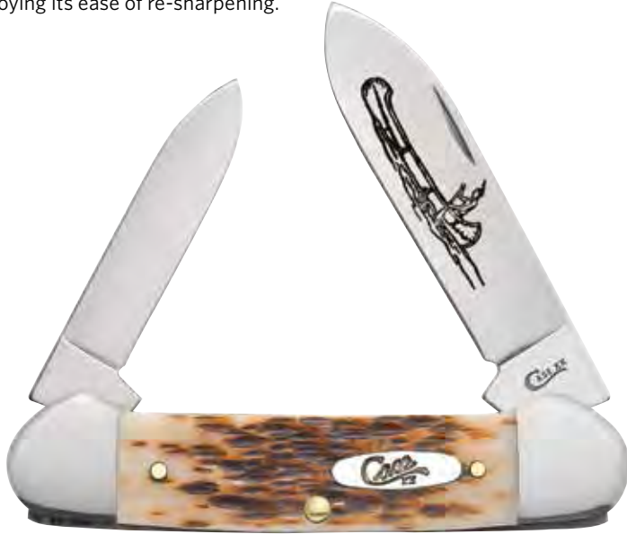
00263 CANOE (ACTUAL SIZE)

Many Case users call on our traditional alloy steel blades to get the job done right while enjoying its ease of re-sharpening.