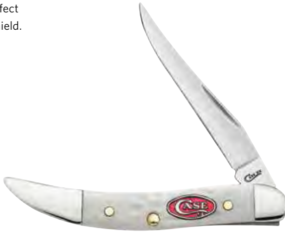
60180 SMALL TEXAS TOOTHPICK (ACTUAL SIZE)

The pure white handle is the perfect counterpart to the vibrant red shield.