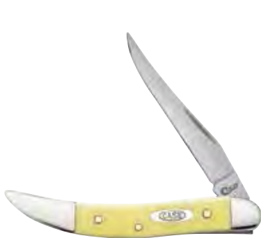
00091 SMALL TEXAS TOOTHPICK

These work-ready, Yellow Synthetic knives are built for use all day long. Many prefer carbon steel for its edge holding ability.