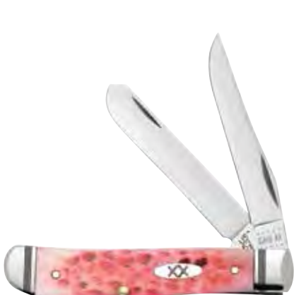
NEW 27721 MINI TRAPPER