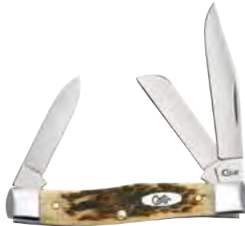
00079 MEDIUM STOCKMAN