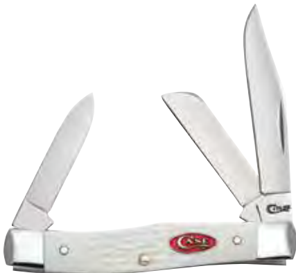
60184 MEDIUM STOCKMAN