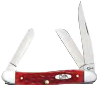
06999 MEDIUM STOCKMAN