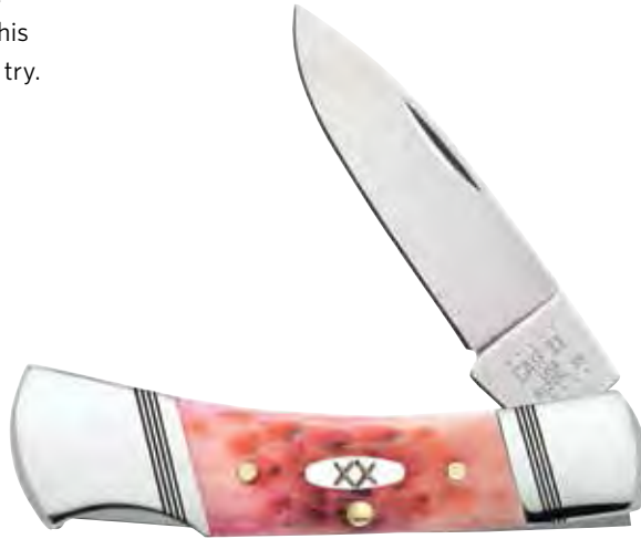
NEW 27724 LOCKBACK (ACTUAL SIZE)

The luscious look of the pinkish handle, with elegant strike lines on the knife bolsters, make it hard to pick just one pattern in this eye-catching knife series. Go ahead and try.