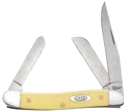
00035 MEDIUM STOCKMAN