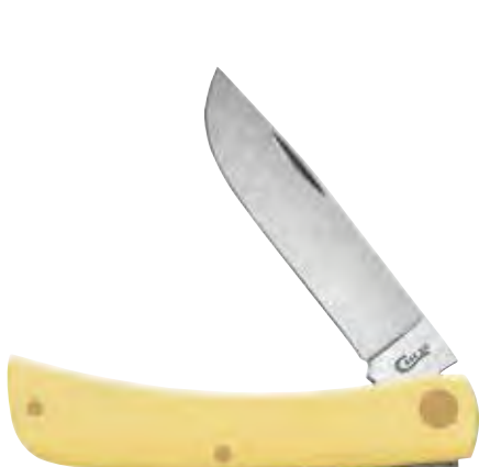
00032 SOD BUSTER JR®