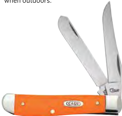
80505 MINI TRAPPER

Radiating with warmth and a sense of adventure, these beaming beauties are perfect for hunters, trappers, fishing pros and even collectors. The vibrant orange shade of the heavy-duty synthetic handles makes them easy to locate when outdoors.